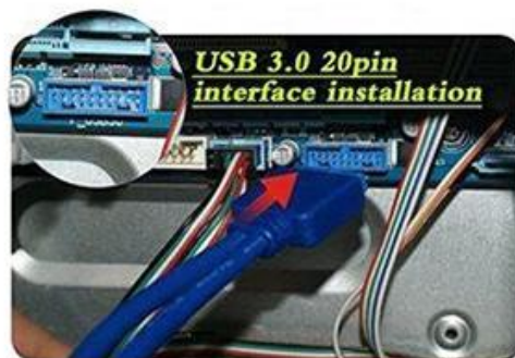
Connecting the USB3.0 20PIN to interface in motherboard