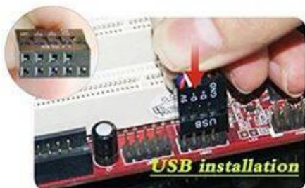
Connect the card reader USB cable to the USB port on the motherboard