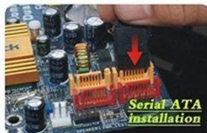
Installation connect the SATA cable to the mainboard