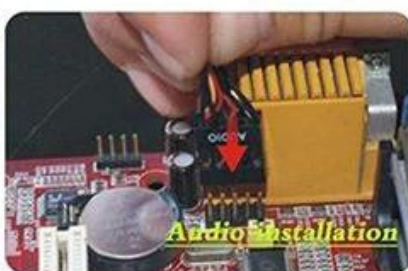
Connect the audio connector to the motherboard