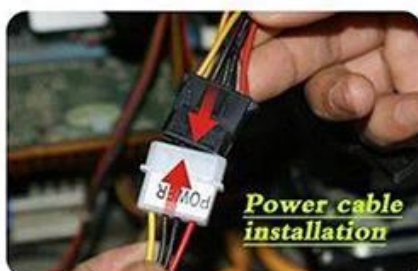
Connect the 4-Pin power connect to your 4-Pin power supply connector