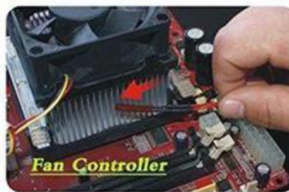
Connect the connector labeled "CPU FAN" to the connector on the CPU Fan