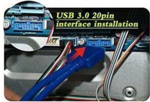
Connecting the USB3.0 20PIN to interface in motherboard