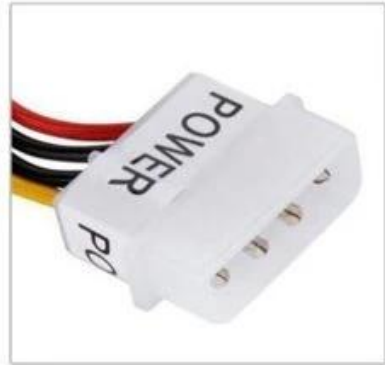
Power x 1 (35cm)