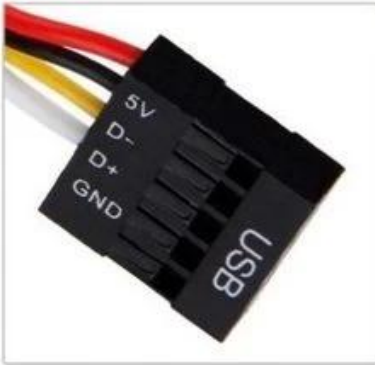
USB 2.0 x 1 (50cm)