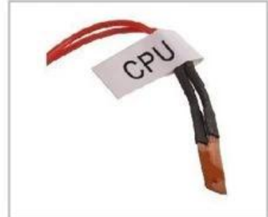
CPU x 1 (45cm)