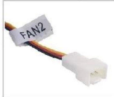
Fan2 x 1 (40cm)