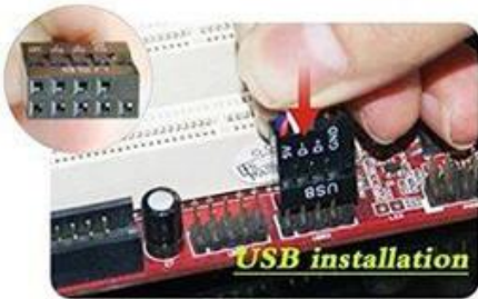
Connect the card reader USB cable to the USB port on the motherboard