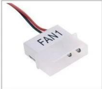
Fan1 x 1 (40cm)