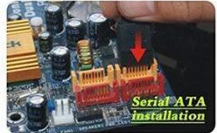
Installation connect the SATA cable to the mainboard