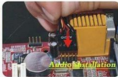
Connect the audio connector to the motherboard