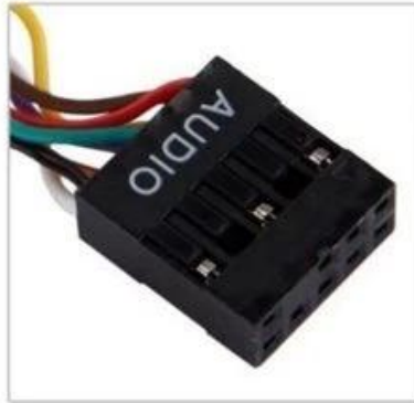
Audio x 1 (50cm)