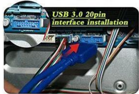
Connecting the USB3.0 20PIN to interface in motherboard