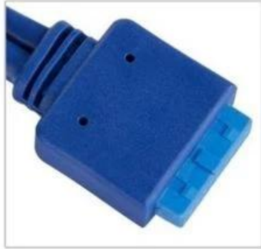
USB 3.0 x 1 (50cm)