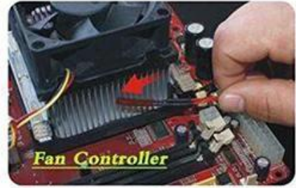
Connect the connector labeled "CPU FAN" to the connector on the CPU Fan