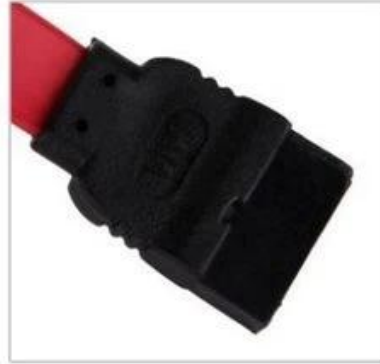
SATA x 1 (45cm)