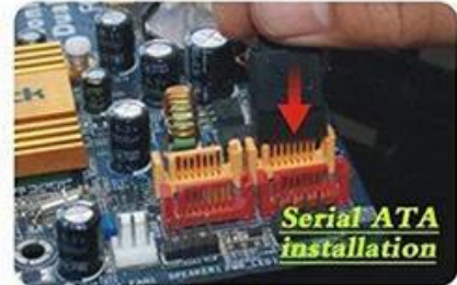
Installation connect the SATA cable to the mainboard