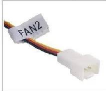
Fan2 x 1 (40cm)