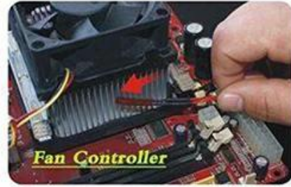
Connect the connector labeled "CPU FAN" to the connector on the CPU Fan